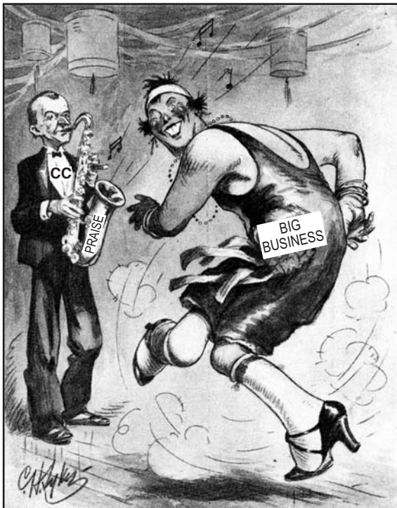
Yes, Sir, He's My Baby!